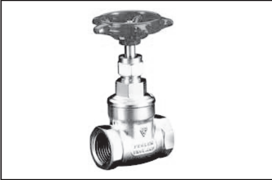
Forged brass full bore gate valve BS 5154 PN20 series B, female ends AB