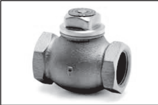
Bronze horizontal lift check valve Female ends, PN32