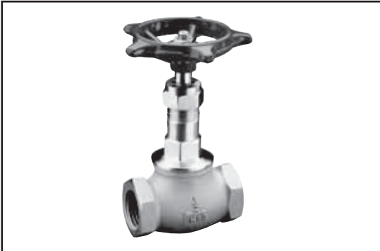
Bronze threaded globe valve with renewable non-metallic seat disk, female ends, PN32